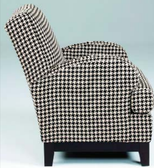
RIGHT: Classic boundstooth check upholstery is perfect for Dad, especially when covering the handsome Cadalin chair by Best Chairs Inc., a custom upholstery vendor. The backs and tops of the arms are accented with French seaming, and the tall, arched arms roll out over the top of the reversible T-cushion. Visit Maximum Furniture for your custom piece.