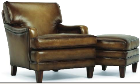
ABOVE: The Evans chair by Flexsteel is a special mixture of elements, including a front T-cushion, a slightly scaled English arm and a loose back pillow. Note the welt detail and tapered block legs. Suggested retail value with ottoman, about $1,000. Leather Furniture Shoppe is a Flexsteel dealer.